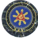
RODRIGO ROA DUTERTE President of the Philippines