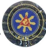
RODRIGO ROA DUTERTE President of the Philippines