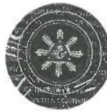
RODRIGO ROA DUTERTE President of the Philippines